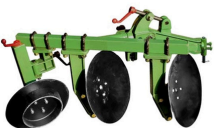
2 Disc Plough